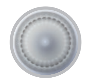
Dividing head 1:30