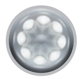
Dividing head 1:8

Anodised aluminium dividing heads -1:8 and 1:10 – are available for materials and suspensions with abrasive properties. And for especially aggressive solids and suspensions, the resistant PTFE-coated aluminium dividing head 1:30 is available.