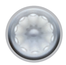
Dividing head 1:10