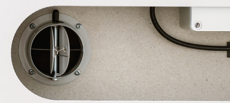
self-closing fire damper