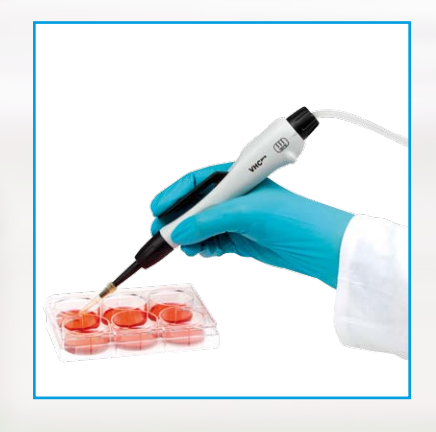
Fully autoclavable, ergonomic hand set