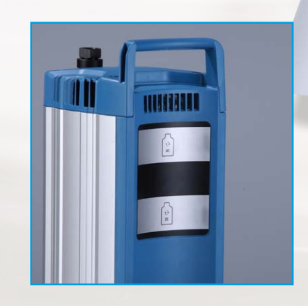
Non-contact liquid level sensor - wearfree, simple bottle exchange