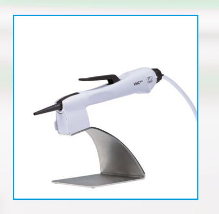
Complimentary range of accessories including table stand, tip ejector and BVC shuttle