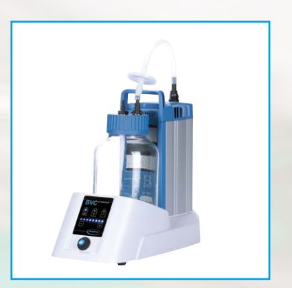
Version with glass bottle - for aggressive media, smaller quantities and quick autoclave