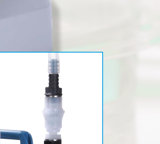
Quick-couplings PVDF - autoclavable,