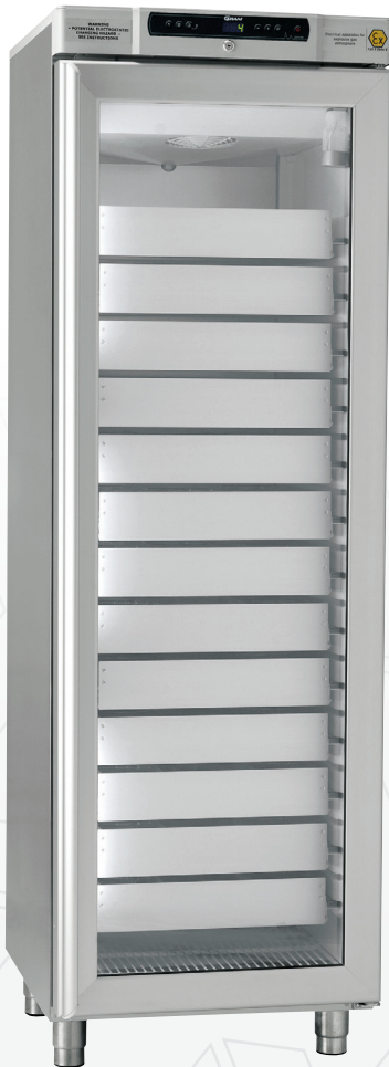
BioCompact II RR410. Drawers and glass door are optional extras.

The BioCompact II 410 is a large refrigerator or freezer cabinet with a small footprint, designed for a wide range of biostorage purposes where the prime focus is on dependability and exceptional performance.