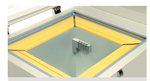
Uniform Sample Storage The uniform and stable temperatures provided are ideal for storage of cells, tissues and other important biological samples.

Alarm and safety devices ensure high levels of protection in case of high temperature deviations, power failure or filter blockage. ATN models are also equipped with an auxiliary liquid nitrogen back-up system for added protection.