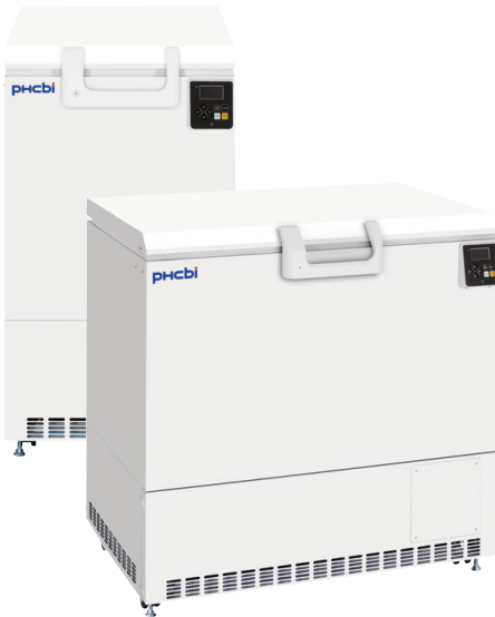
MDF-DC102VH-PE / MDF-DC202VH-PE