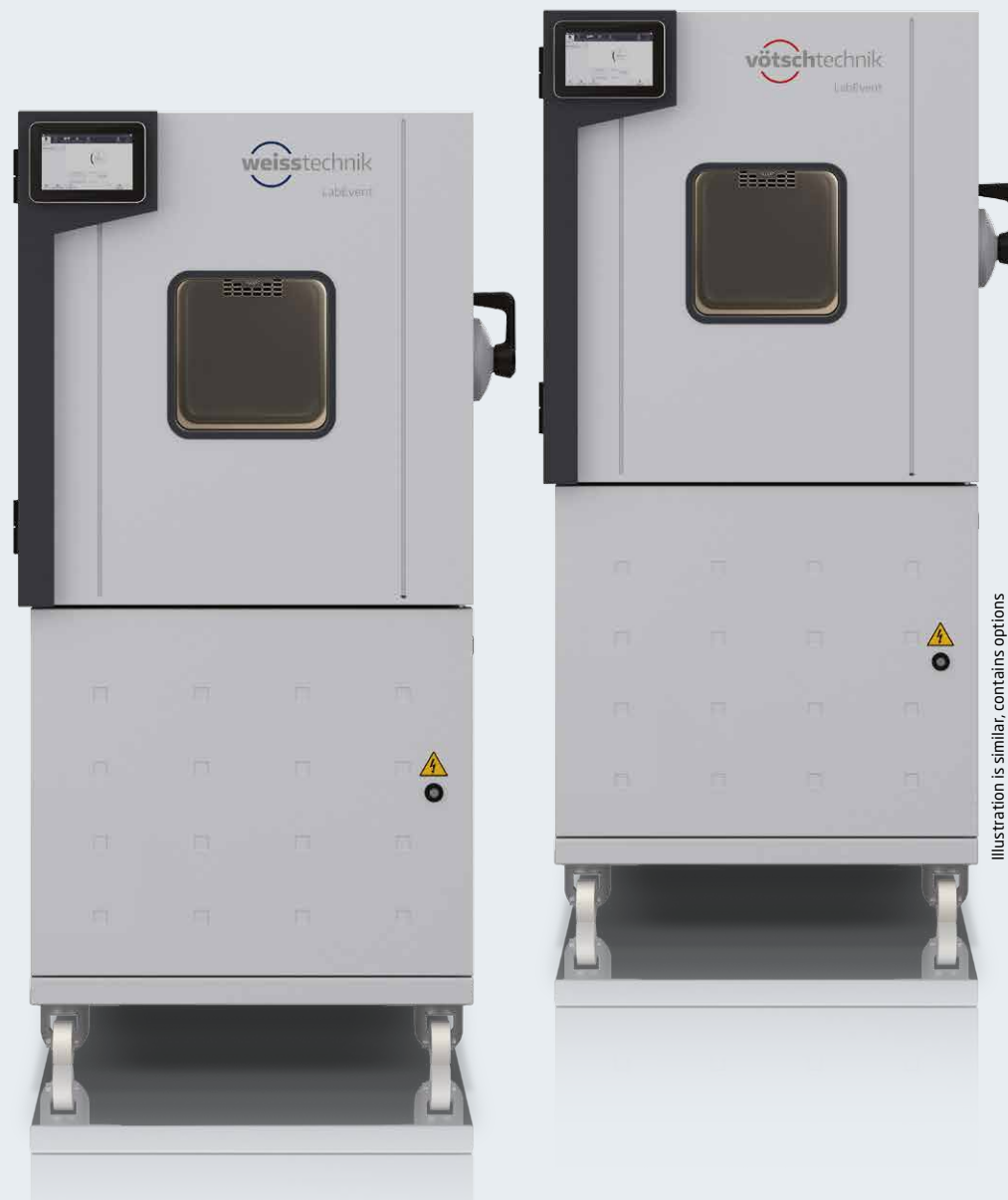
Illustration is similar, contains options

You can find further details on equipment in our technical descriptions. Contact us.