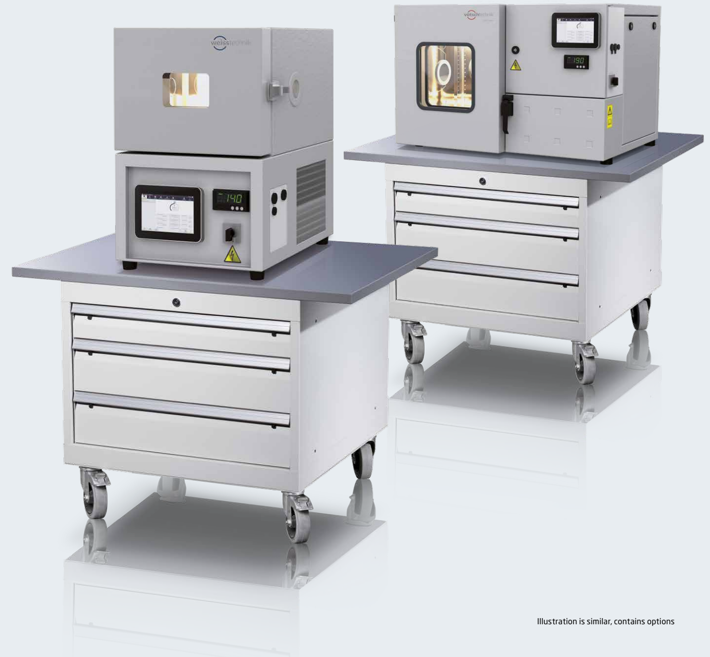
Illustration is similar, contains options

You can find further details on equipment in our technical descriptions. Contact us.