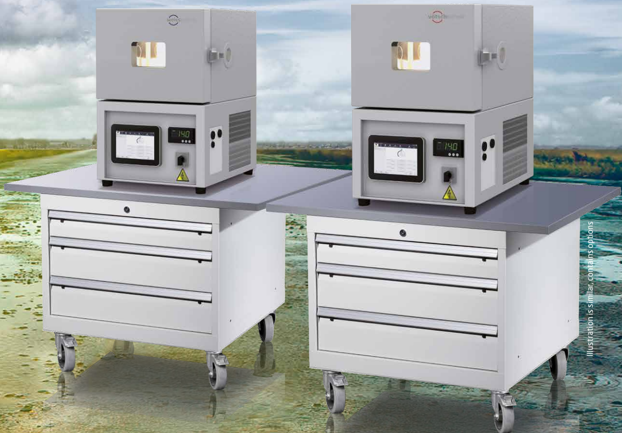
Illustration is similar, contains options