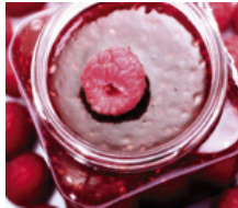
Food / Beverage