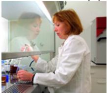
Basic Research / Research Institutes